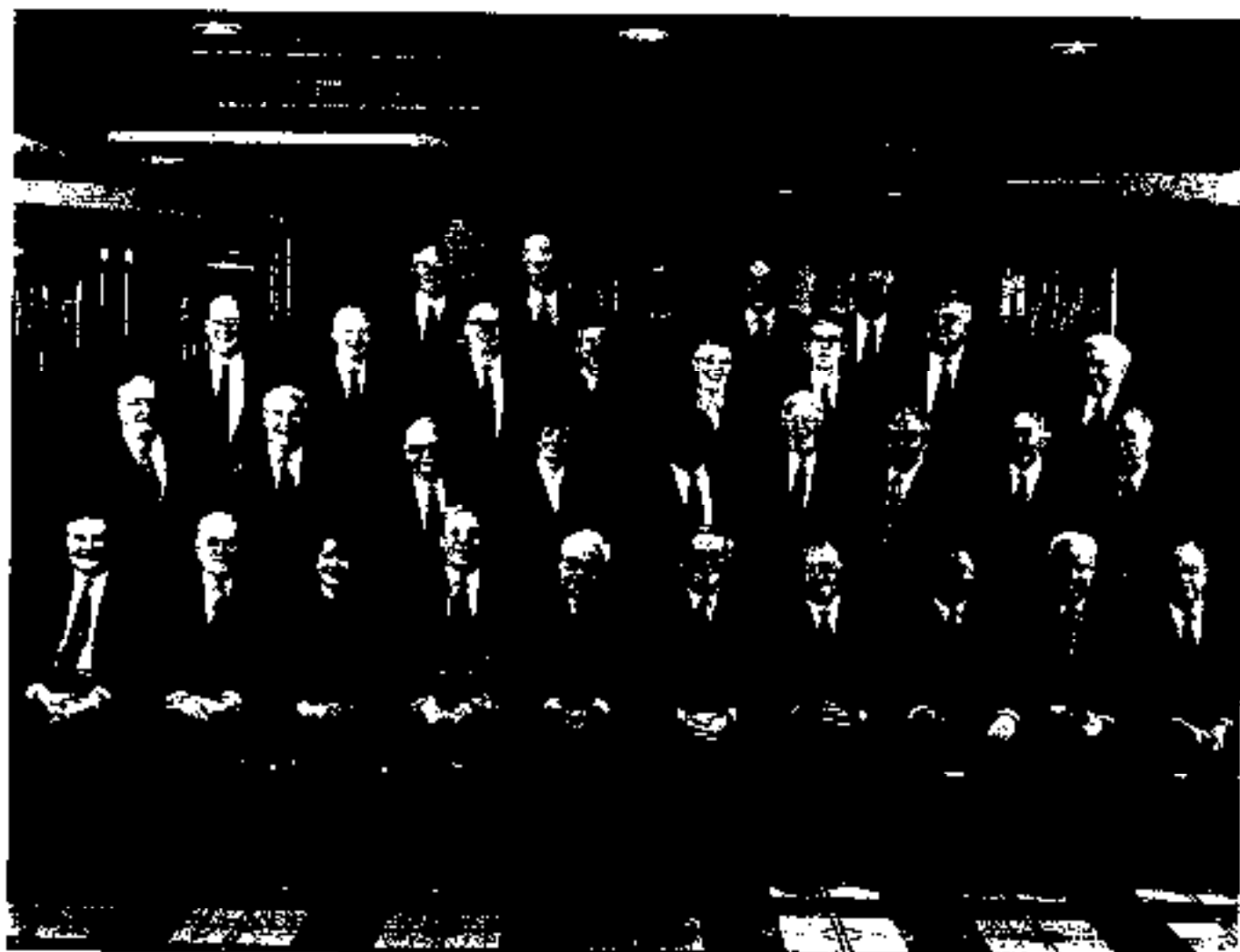
Members of the Canadian Judicial Council, 1965 Annual Meeting